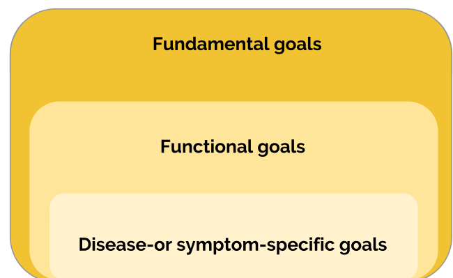
FIGURE 1 Three-goal model for clinical practice. This figure shows that disease-specific or symptom-specific goals flow from functional goals and both flow from fundamental goals

Fundamental goals can be seen as a translation of elements like values, core relationships and priorities in life, into concrete goals. If, for example, both autonomy (quality of life at home above prolonging life in a nursing home) and staying with and taking care of your disabled child as long as possible, are important to a person, this conflict and/or trade off in these important values/life goals/core relationships can be discussed and translated into a fundamental goal. For example,